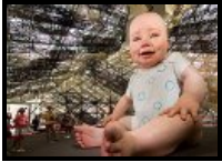
World's Strangest Statues