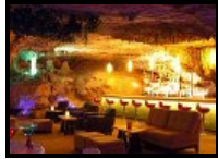
World's Strangest Bars