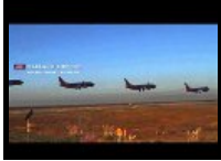
Look, Up in the Sky! It's a Bird... It's a Plane... Yes. It's a Plane...